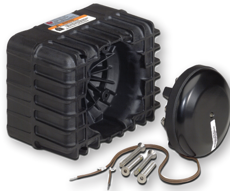
Demonstrates the field replaceable driver.